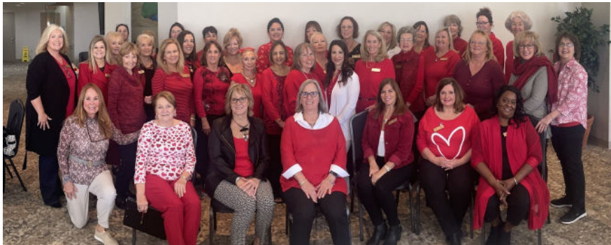
Cocoa Beach Woman's Club

Submit photos and a short story about the awesome things YOUR club is doing in the community to PR@gfwc.org .