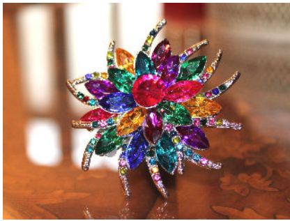
$100 Large Pins (2.5in diameter)