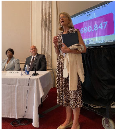
Senator Lisa Murkowski (R-AK)