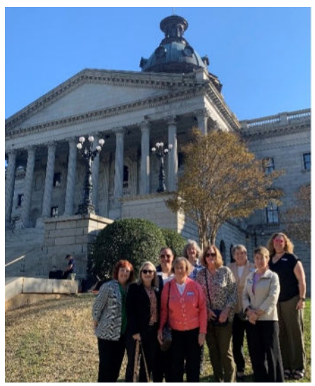
GFWC South Carolina outside the State Capitol