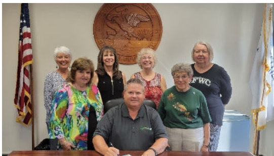
GFWC Effingham Women of Today (IL)