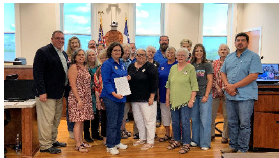
GFWC Pierian Club (TX)

To commemorate the 2024 GFWC National Day of Service (NDS) on September 28, reach out to your elected officials: mayors, county commissioner/council members, state representatives, governor, and Members of Congress for a