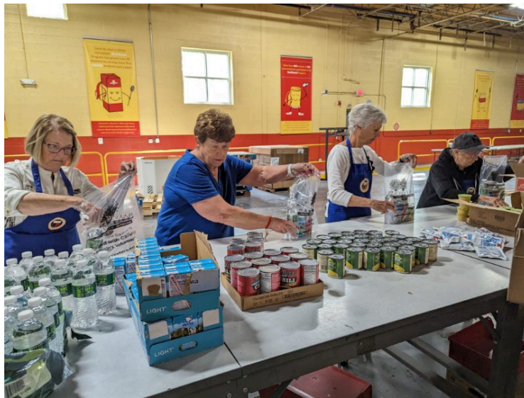
Nu Era Study Club, GFWC Missouri