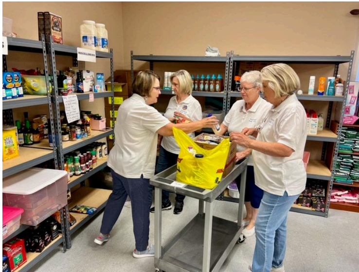
GFWC Hueytown Study Club - Alabama