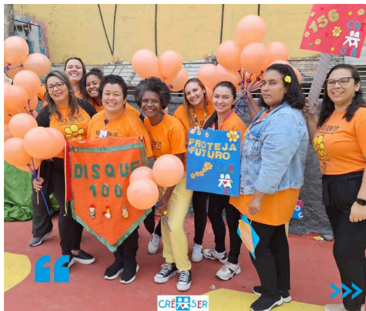
GFWC Cre-Ser, Brazil