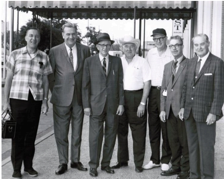
Members of the General Federation Boosters, circa 1977