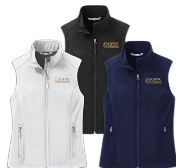
GFWC Zipper Vests