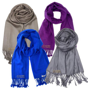
GFWC Pashmina Scarf

Available in Blue, Black, Gray, Taupe, and Purple